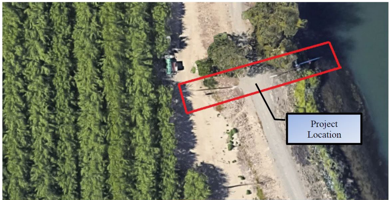
3) Approximate project footprint map