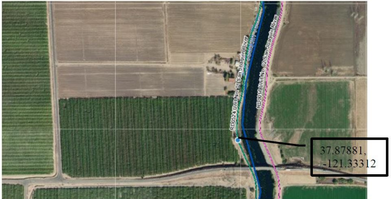
2) Proposed project location map